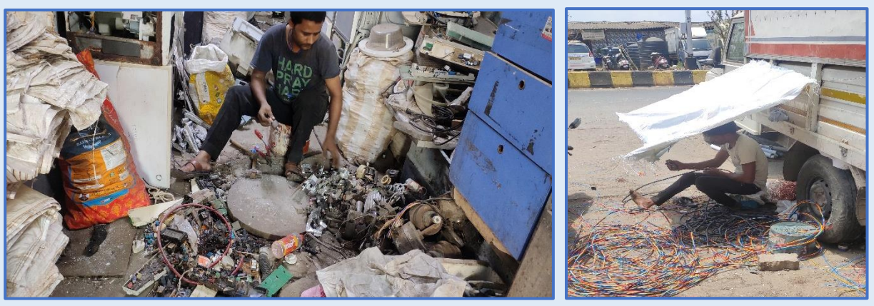
Fig 4: Waste workers dismantling E-waste

In India, the e-waste management still revolves around the informal sector involving children, women and aged people, causing health effects to the vulnerable population. The E-waste management rules are a great foundation to bring it into a formal and well-structured system. The EPR rule, which make the process responsible for waste management, has brought in good governance, but the capacity needs to be increased. 94 Producer Responsibility Organisations(PROs) are registered with CPCB, and 569 recyclers or dismantlers with nearly 1.8 million metric ton capacity per annum.