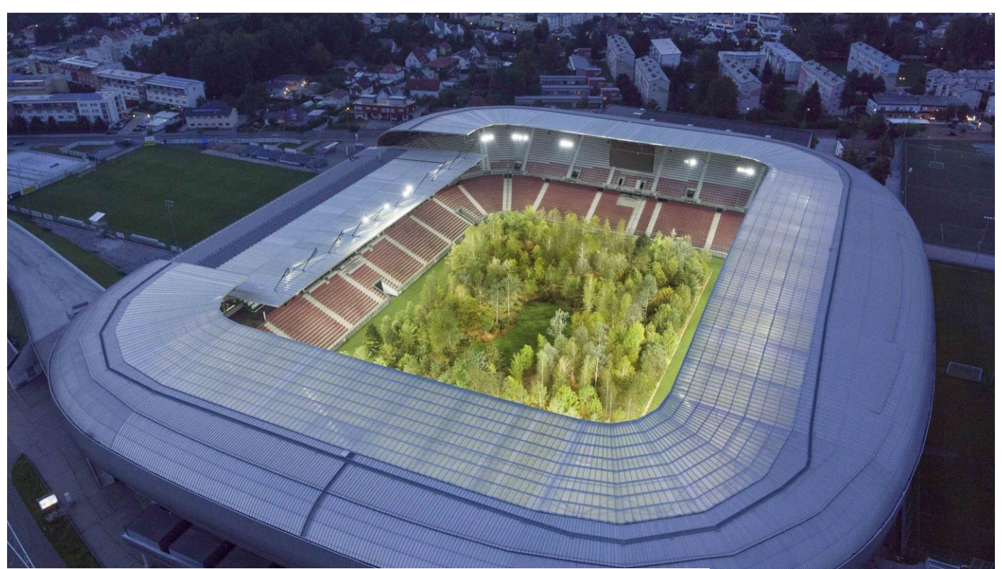
For Forest-The Unending Attraction of Nature, an exhibition in Austria.

Swiss-born Klaus Littmann has created a spectacular work of physical art meant to remind us that nature may someday be found only in specially designated spaces